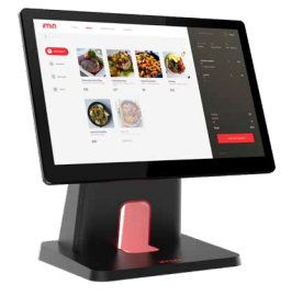
D3-504 Display: 15.6″ Display: 15.6"(FHD) 1920x1080

Manage your queue, order and transactions easily with D3.