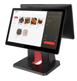
D3–506 Display: 15.6″ + 15.6″ Main Display: 15.6"(FHD) 1920x1080 Secondary Display: 15.6"(FHD) 1920x1080